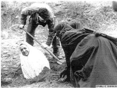
Young mother in East Azerbaijan Province being buried to be stoned to death for "fornication while married"

As women, we have indeed come along long way since the days of the Hammurabi Code 1 when we, along with racial minorities, were codified as chattel to be protected, bartered, and sold. Many of us are part of religious traditions which have vestiges of this patriarchal social ordering of women as the "second" sex, but by and large as Americans living in the 21 st c.—whether one identifies with the feminist movement or not, whether one is religious or not, regardless of one's political affiliation—we are products of a different view of humanity, a different world view, one which revolts against any notion of "second"-class citizen, slavery or a human "caste system" in which any one group of people—whether it be a certain race, religion, ethnic group or gender—is given legal or cultural power to control or rule over another.